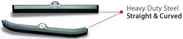
Heavy Duty Steel Straight & Curved